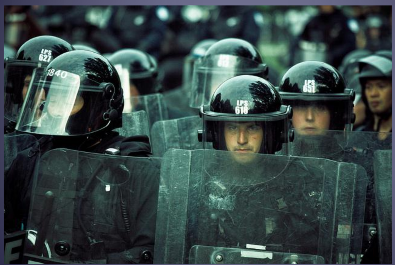
Untitled by squirrel brand CC