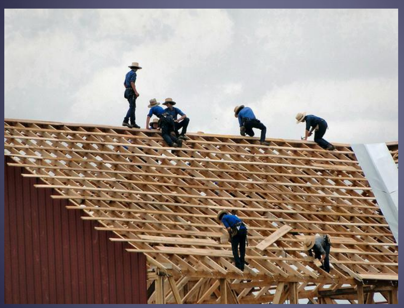
Hard Work by Walt Cindy47452 CC