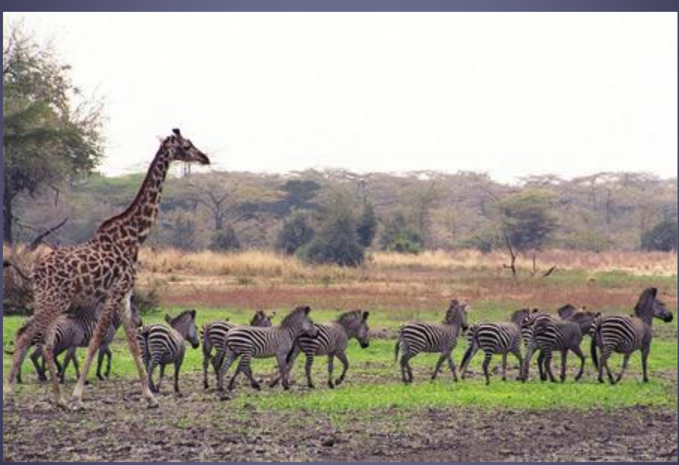
Apart from the Crowd