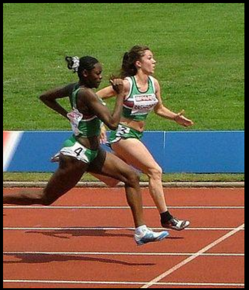
SPAR Sprints 100m under 17 Women